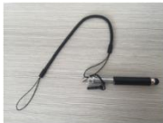
Straps and Touch pen